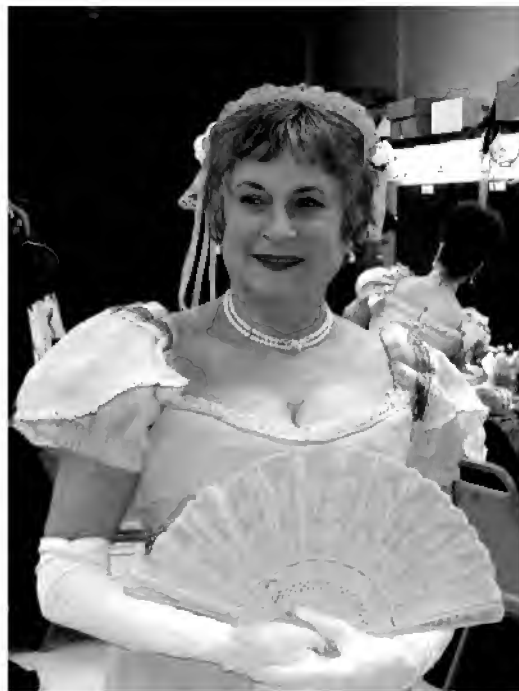
In the Anchorage Opera Chorus for the performance of Eugene Onegin, 2010.

years isn't bad. Sincere and heartfelt thanks to her for her service to PSG, contributions to seabird biology, and her friendship.